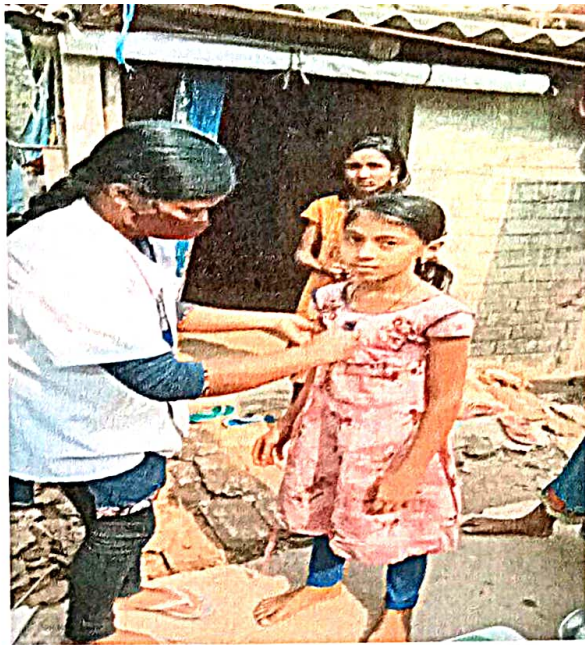
Plate1 : Different activities during survey of Muslim children of Bhagwanpur-II Block area